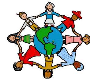
We carry them always in our hearts