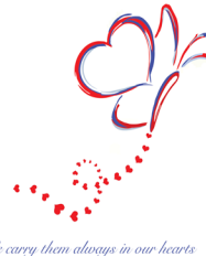
We carry them always in our hearts